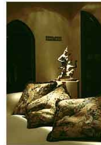
Fig 2. MR16 lamps used in residential applications