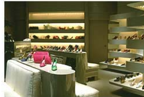
Fig 1. MR16 lamps used in retail applications

Monthly usage Hours: 30 days X number of hours (12 hours per day) Electricity cost per KWH: US$1.00 LED MR16 wattage: 4W Halogen MR16 wattage: 20W